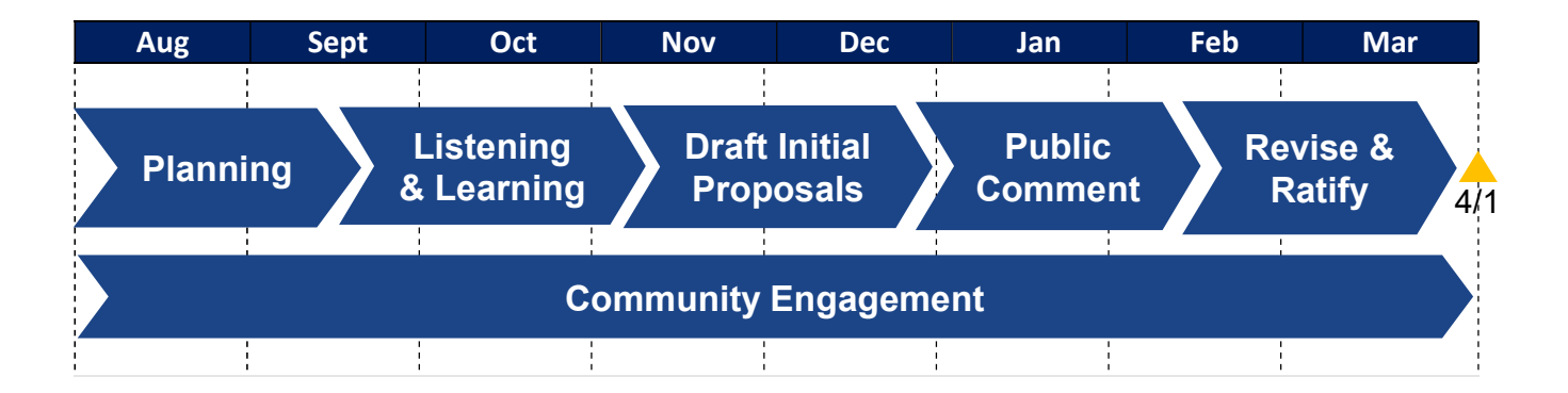
Phase 1: Planning (August-September 2020)

Create an operations plan: Create a work plan for your process and identify staff to manage the information gathering and plan development. Many localities have already begun this process. If appropriate, hire any external consultants or facilitators. You can also develop a preliminary list of the critical issues that need to be addressed through the plan development process, based on the material provided in Part 1 of this guidebook.