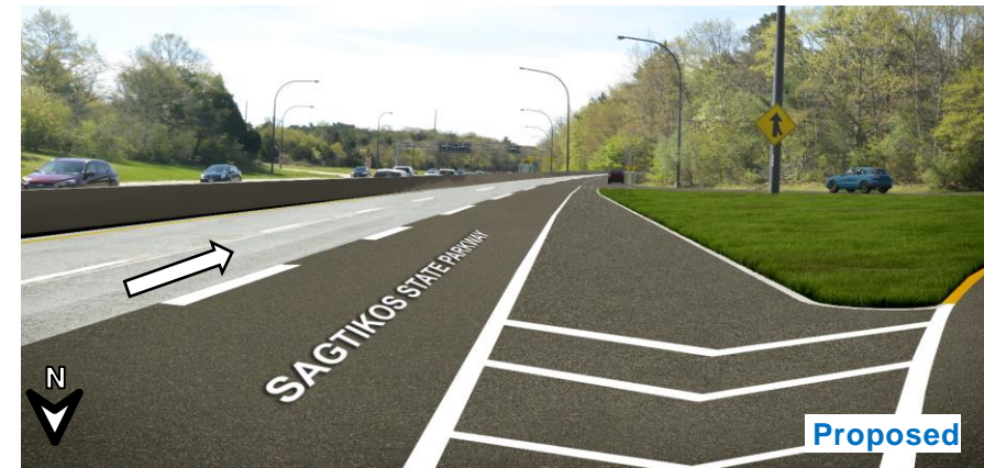
Ramps from eastbound and westbound LIE to southbound Sagtikos State Parkway and to Crooked Hill Road.